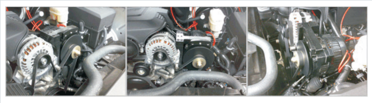
Alternator in a GMC with belt routing